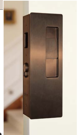
7 - CL400 Key/Snib option. Oil Rubbed Bronze finish.