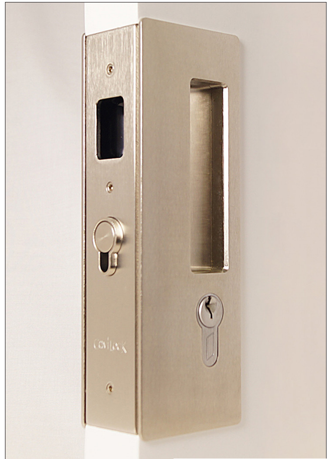
6 - CL400 Key/Key option. Satin Nickel finish.