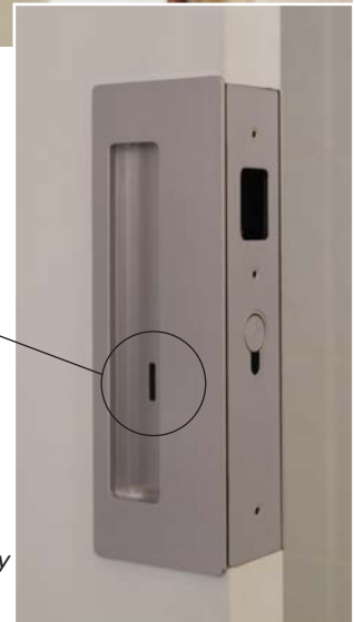
5 - CL400 Privacy - Emergency Release/Snib option. Matte Chrome finish.

Emergency Release can be activated with a pen in an emergency.