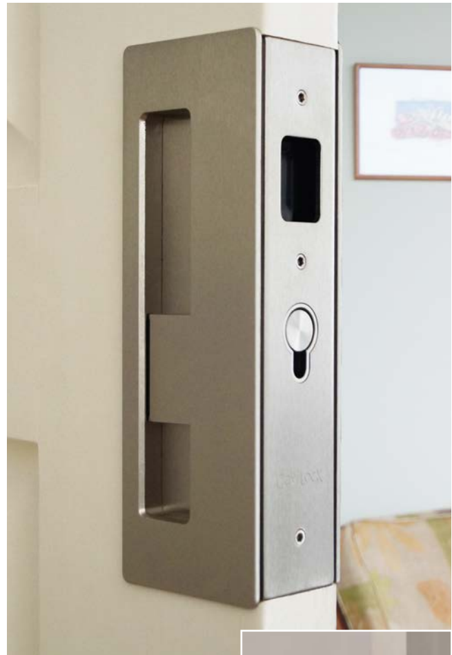
4 - CL400 Privacy Snib/ Snib option. Satin Nickel finish.