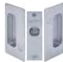
CONFIGURATION D Passage - Both Sides Blank