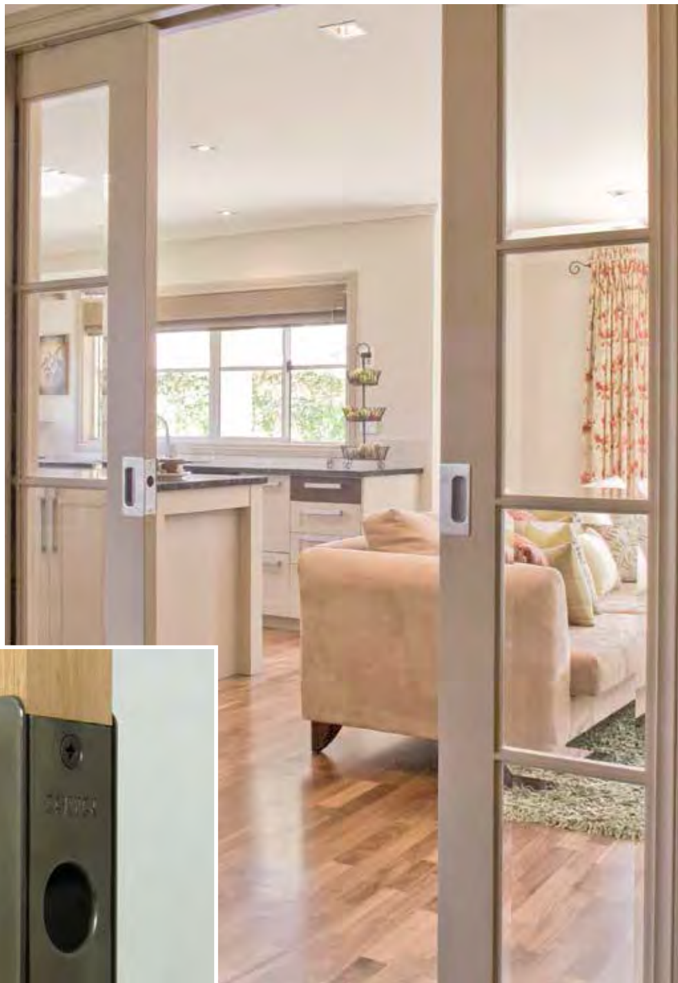
Bi-Parting pocket doors with CL200 Passage handles in satin chrome.

The front face plate on the CL200 incorporates a recessed edge-pull to allow the door to be withdrawn from the pocket when fully open. The CL200's deep recessed side pulls make even heavy doors easy to slide.