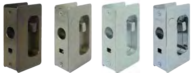
1210 / 1215 Oil Rubbed Bronze 1090 / 1095 Satin Nickel 1010 / 1015 Satin Chrome 1020 / 1025 Chrome

Other finish options available on request. (Note: Longer lead times and additional surcharges may apply.)