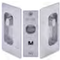
CONFIGURATION A Privacy Snib Both Sides or Snib / Emergency (option when fitting)