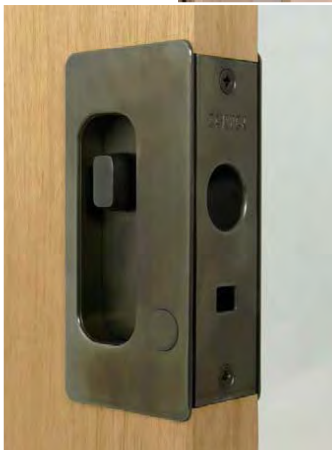
A CaviLock CL200 Privacy handle in oil rubbed bronze.