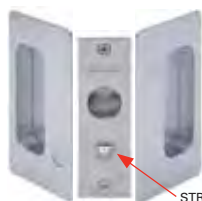
CONFIGURATION E Passage with Striker For use only with Bi-Parting doors to match the Privacy A Configuration (Both Sides Blank)