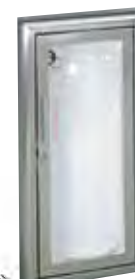
CLEAR VU 1537G25 WITH SAF-T-LOK™

Tub: Constructed of cold rolled steel with white powder-coat finish standard. Extinguisher must be mounted to back of tub using bracket.