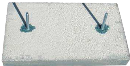
(special order, additional cost)