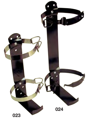
023 Double Strap 024 Double Strap