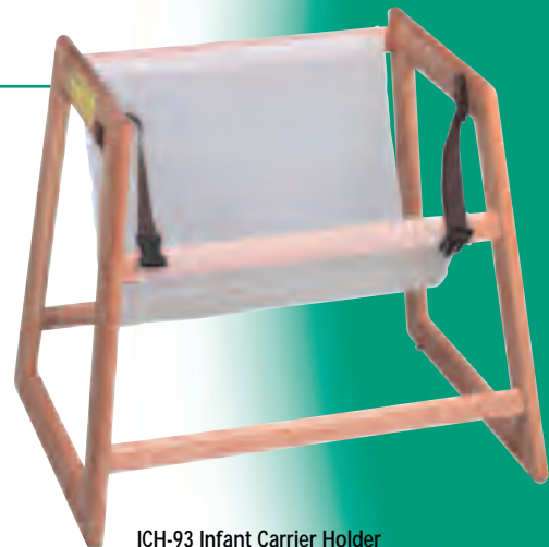
ICH-93 Infant Carrier Holder