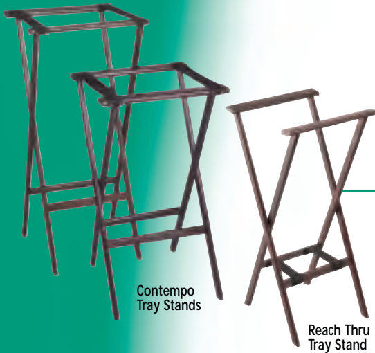
Contempo Tray Stands

Tray stands available 30" (762 mm) or 38" (965 mm) tall