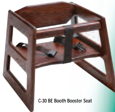
C-30 BE Booth Booster Seat