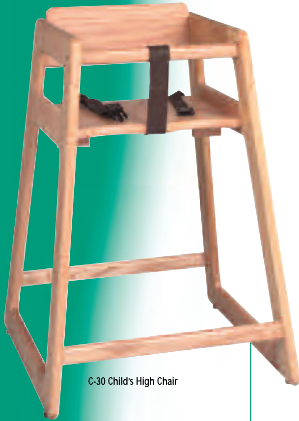
C-30 Child's High Chair

Marston Wood Products feature the signature Marston high chairs as well as booster seats, infant carrier holders and tray stands for the commercial foodservice industry. Marston Wood Products are known throughout the industry for their superior construction and quality. Standard stain colors are FDA approved; contact factory for custom colors.