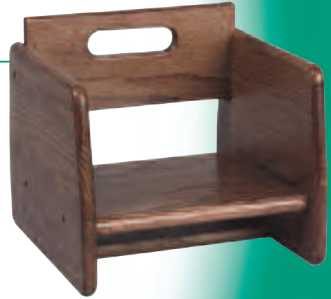
BC-9 Booster Seat

Dimensions: Depth: 12" (305 mm), Height: 11" (279 mm), Width: 12" (305 mm)